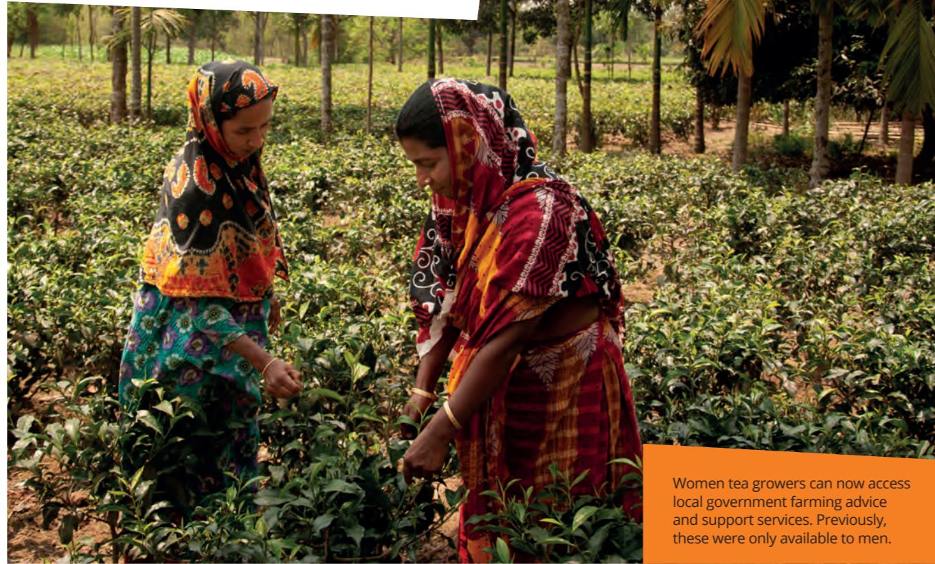
Women tea growers can now access local government farming advice and support services. Previously, these were only available to men.

This project sparked government recognition, investment and support for smallholder tea farmers, especially women.