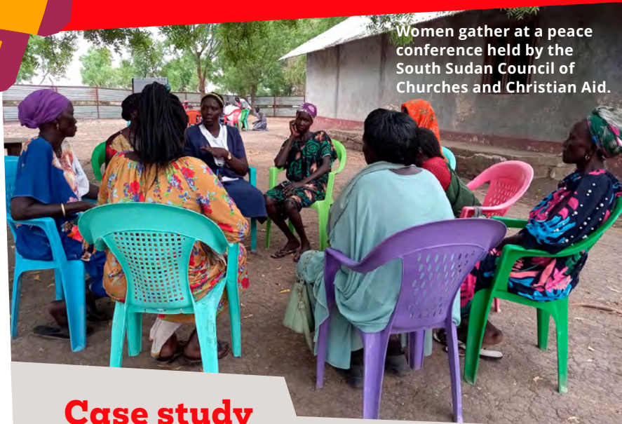
Women gather at a peace conference held by the South Sudan Council of Churches and Christian Aid.