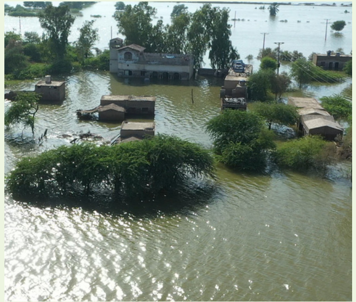
Flooding in Balochistan province, Pakistan, in September 2022. Between 10%-12% of the entire country was flooded. This is one of the costliest weather disasters in human history. Its causes are linked to man-made climate change.

In addition, each of the partner organisations has additional climate justice school resources. There is a directory of these resources at the end of this guide. Please use these resources as you wish.