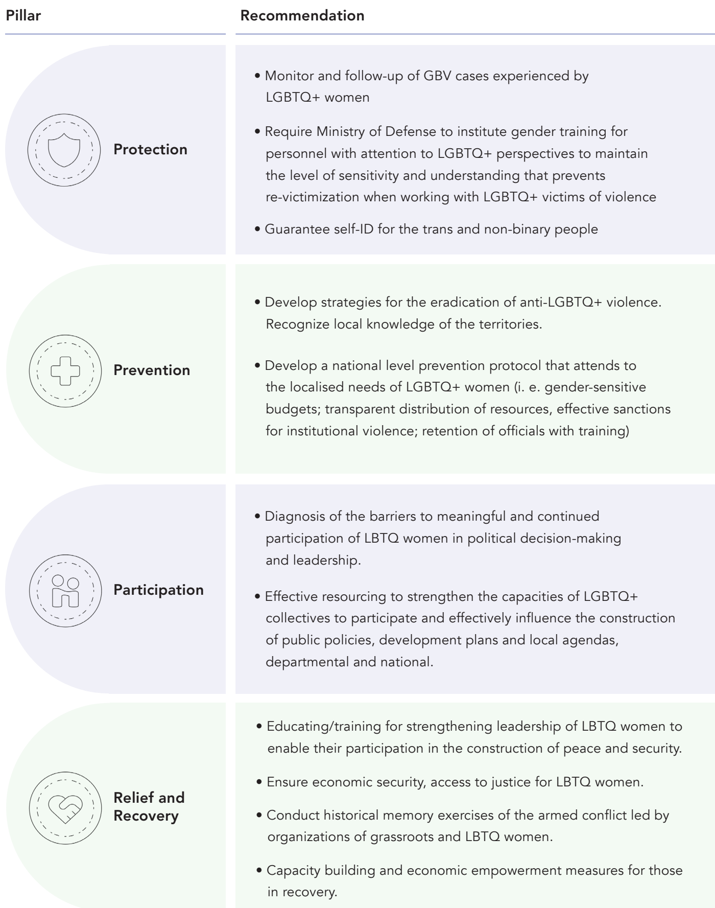
Table 3: Recommendations for how to address needs of LBT women in Colombian NAP