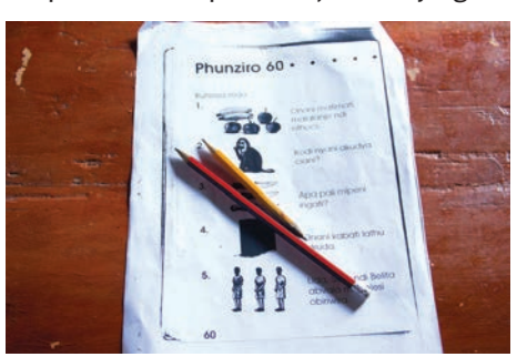
Learning to read and write changes lives, Katete, 2016

"Traditionally women were encouraged to go to school and emphasis was put on just staying at