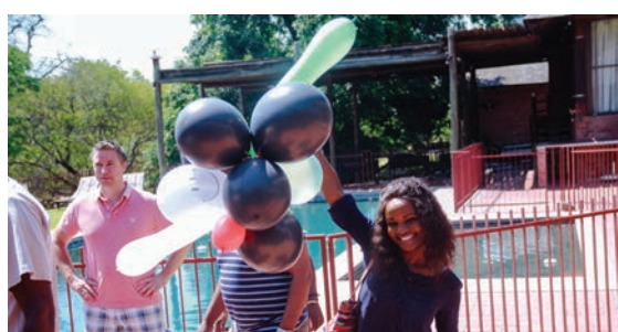
It was a time to relax and have fun

He highlighted the need to do things smarter taking advantage of the various resources and competencies within the organisation. The retreat was a chance to discuss other issues that would help bring about more unity within JCP and with partners.