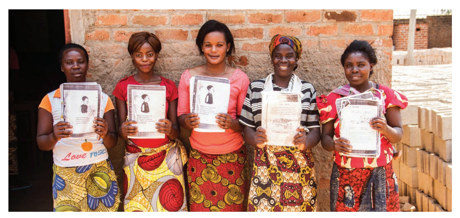
Literacy students show their books, Photo by Bellah Zulu, Katete, 2016