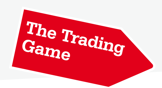
Diagram of shapes

All edges must be cut with a pair of scissors