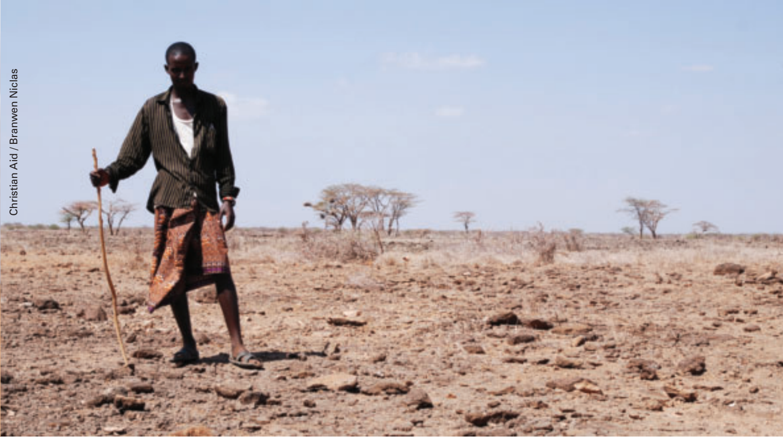
A shepherd with no livestock, in Toricha, near the Ethiopian border. All his livestock died during the recent drought.

‘So far, a total of €481,000/ £423,000 has been raised by Christian Aid supporters and churches throughout Ireland.’