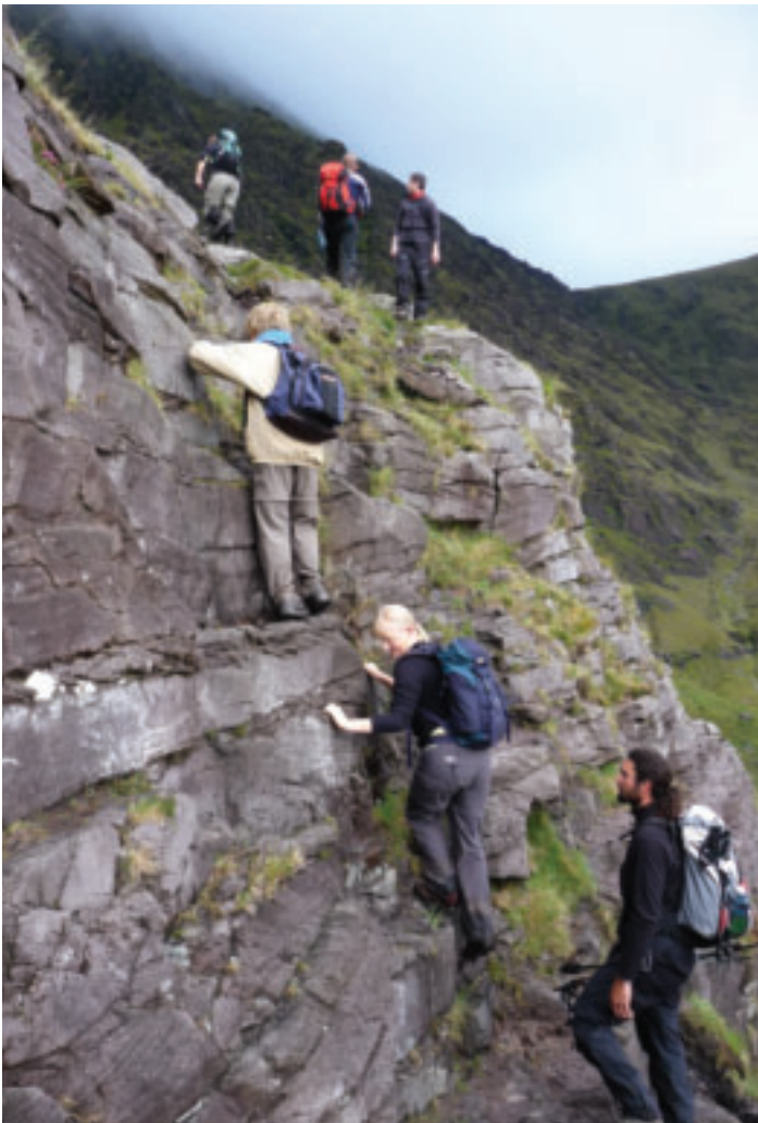
Pushing on for the peak of Ireland's highest mountain, Carrauntoohill in Co Kerry. At this stage, the team know they have only a few hours left before time runs out if they're going to beat the 48 hour limit.