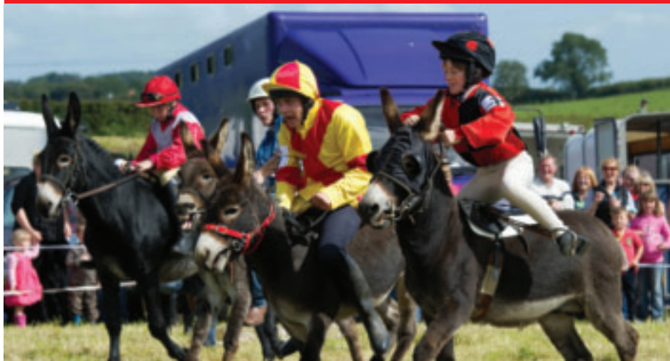
Jockeys going all out at the ever popular Donkey Derby at the Saintfield Horse Show in Co Down. Christian Aid was the chosen charity at this year's show, receiving £3,000.