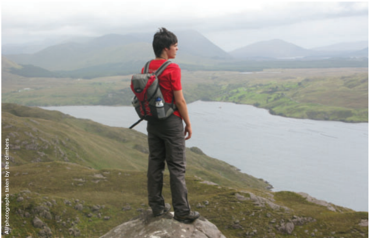
All photographs taken by the climbers

On the last weekend in August, thirteen dedicated supporters of Christian Aid took on the monumental challenge of climbing the highest mountain in each of Ireland's four provinces – in less than 48 hours.