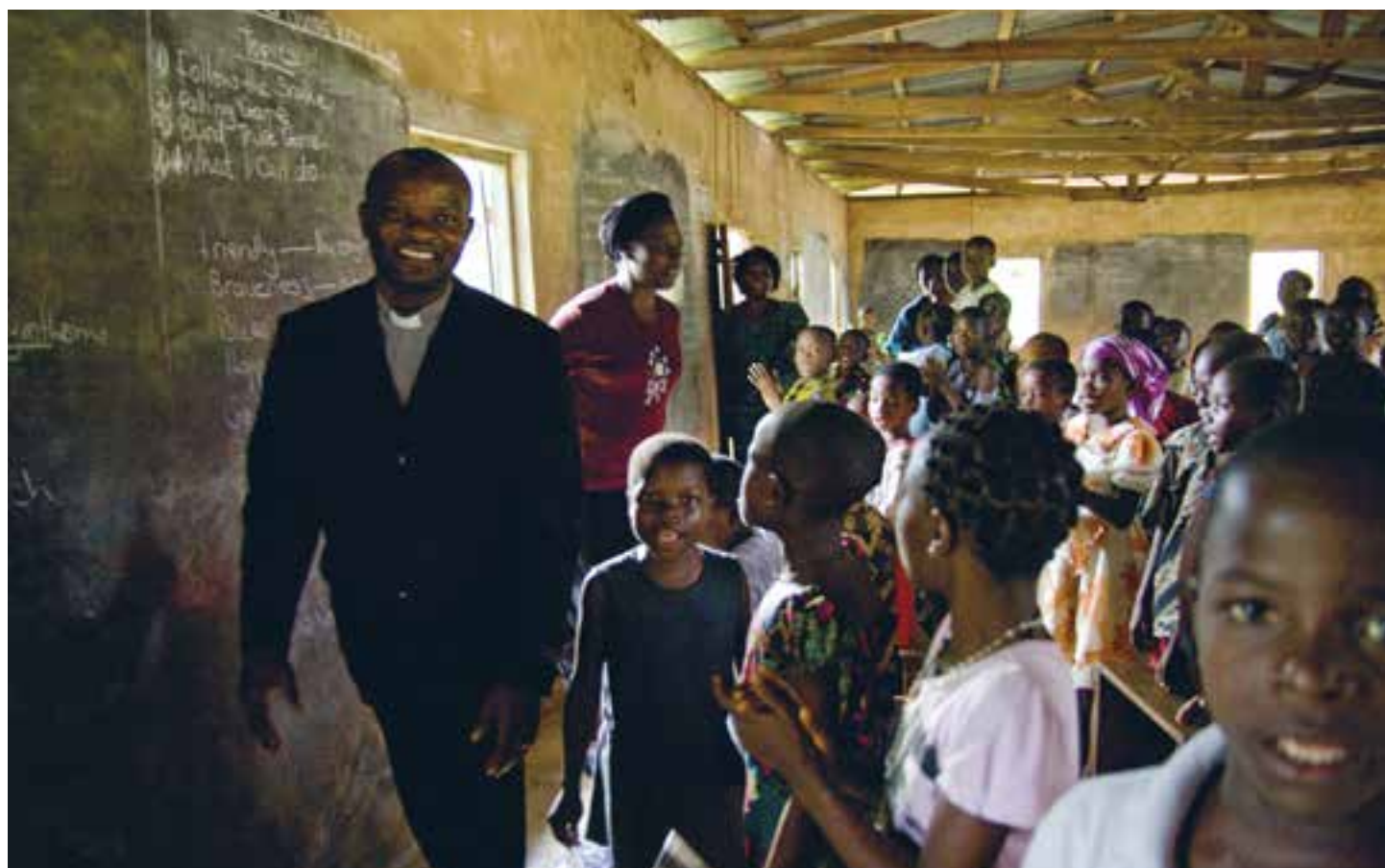
Children sing, dance and play at a kids club for families affected by HIV at Ezicama Uli school in southern Nigeria. The weekly club teaches children about HIV, healthcare and moral issues, helping them to cope with their situation.