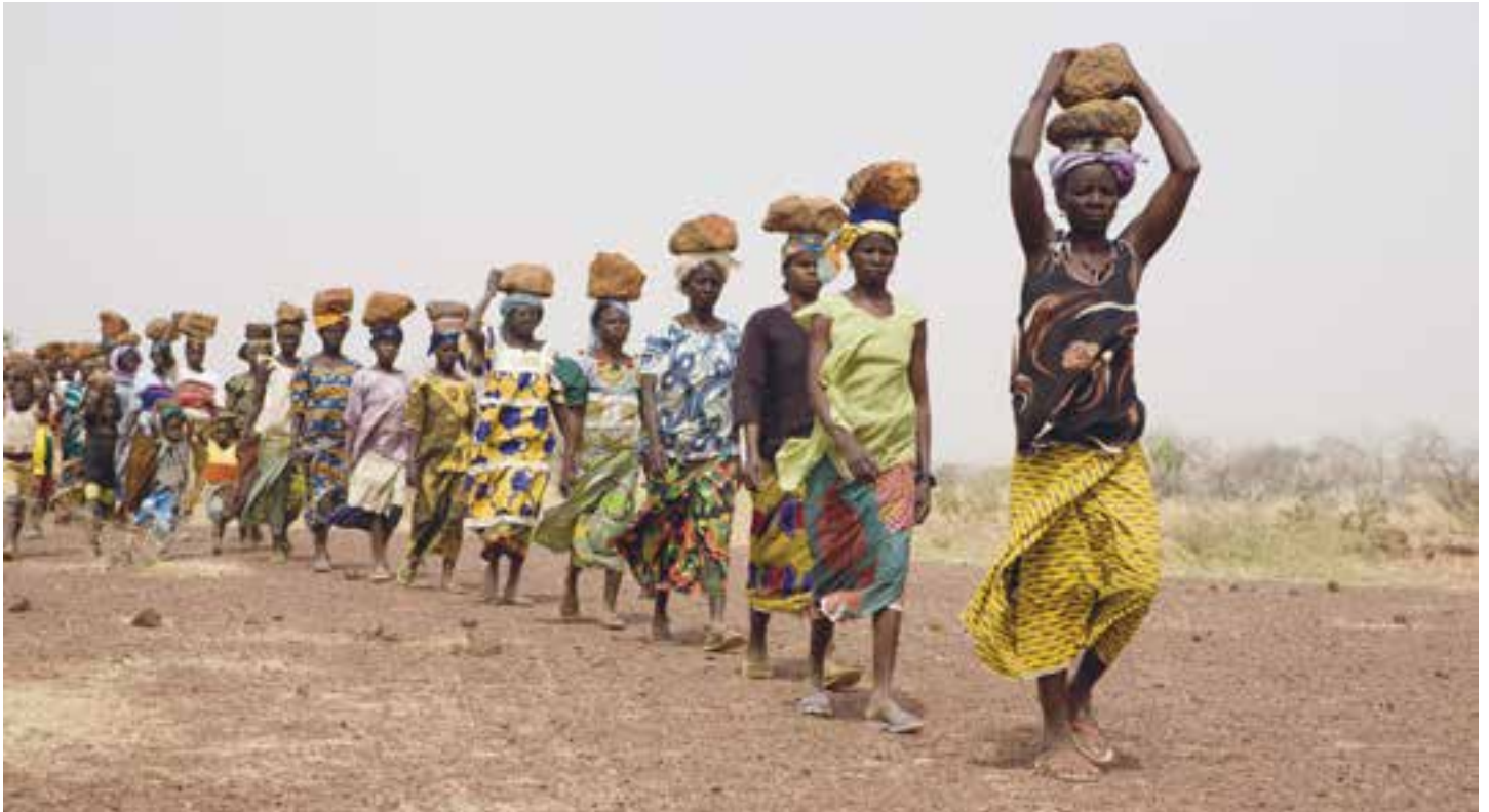
Women in Keleguem village, north-eastern Burkina Faso, carry rocks with which to build rock belts – low walls that help to protect the soil from rain and wind erosion. Built with support from Christian Aid partner Réseau MARP, the walls help crops to grow and yield more food.