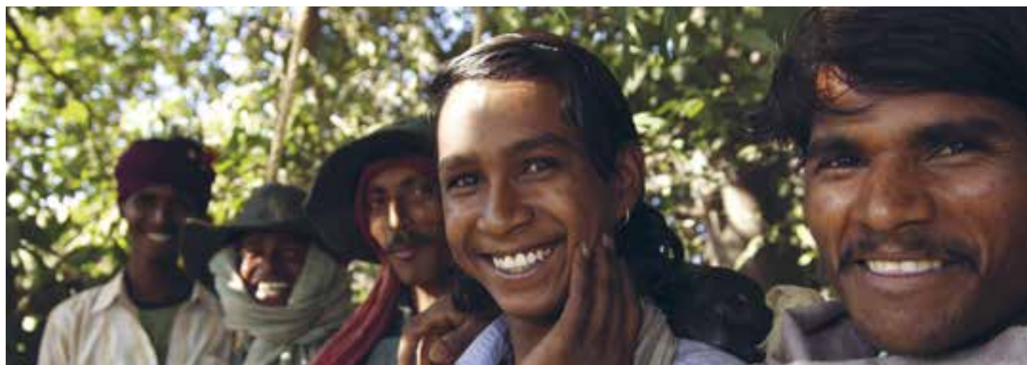
A team of adivasi honey collectors in Udaipur District, Rajasthan. A Christian Aid partner in India has supported forest producers by providing protective clothing, as well as identity cards to help protect them from being harrassed by forest officials.