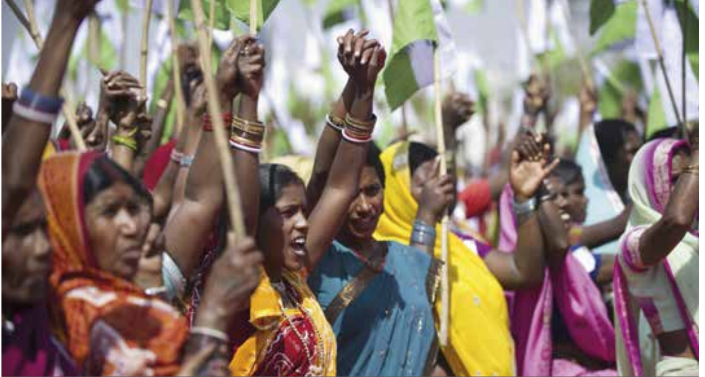
India's landless communities united to campaign for land rights in 2012. The movement was rooted in the experiences of poor Indian communities and organised by Christian Aid partner Ekta Parishad, who stressed the importance of global solidarity to this campaign.